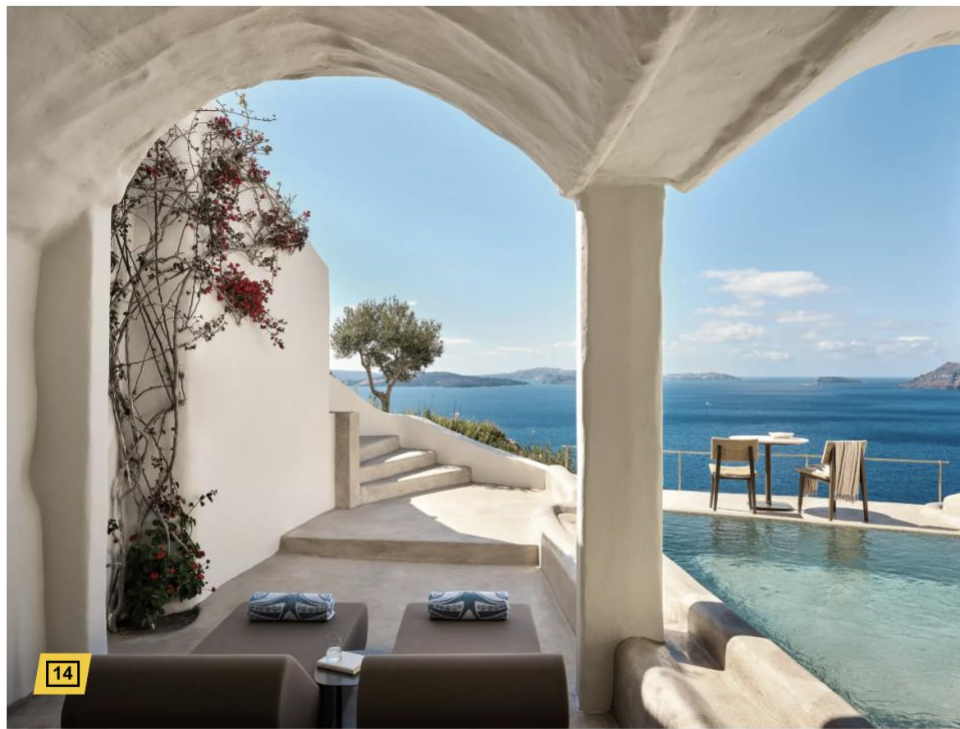
The ultra-luxe hotel offers picturesque views of the Aegean Sea.

The hotel is a known favorite to celebrities including Kim Kardashian, Kendall and Kylie Jenner, Olivia Culpo, Ed Westwick, Chanel Iman and Kanye West — who have all paid recent visits, Page Six can confirm.