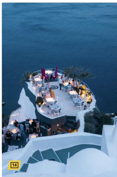
The resort also happens to be home to one of the most famous outdoor dining areas in the world. Andronis Luxury Suites

The resort, which boasts 29 VIP suites carved into the cliffside, also happens to be home to one of the most famous outdoor dining areas in the world: Lycabettus.