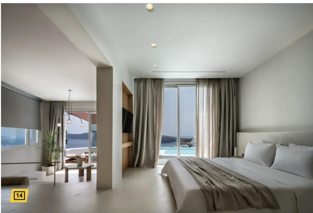
The celeb-magnet hotel has undergone a next-level makeover, now offering 6-star standards while retaining its official 5-star status. Andronis Luxury Suites

Its unmatched commitment to privacy is likely why so many celebrities — and even royals — opt to stay there.