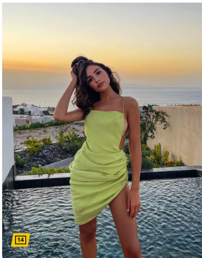
Olivia Culpo stayed at Andronis Arcadia and shared snaps from her Greek vacation on social media.