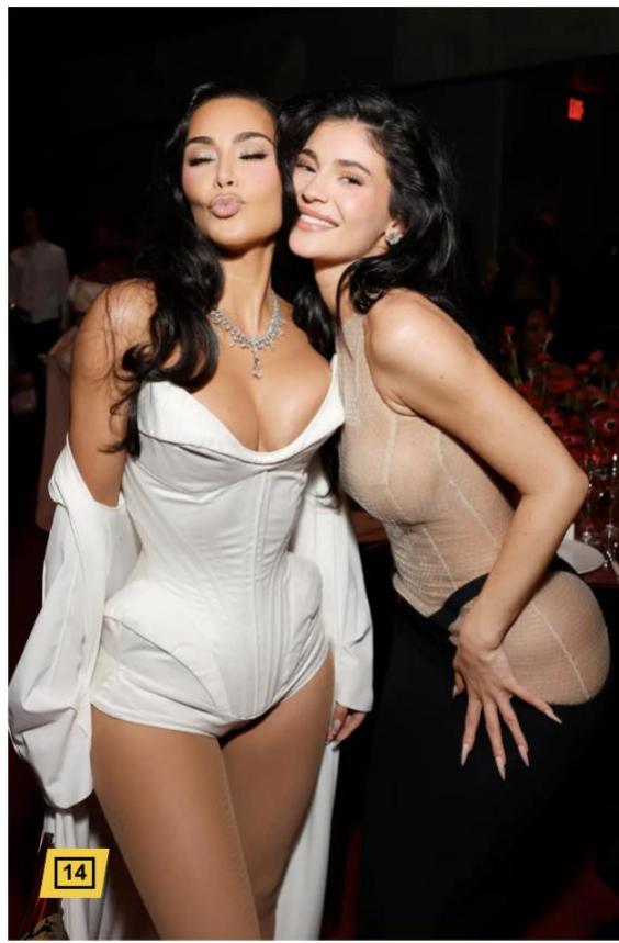
Kim Kardashian and Kylie Jenner have recently visited the luxurious vacation spot.