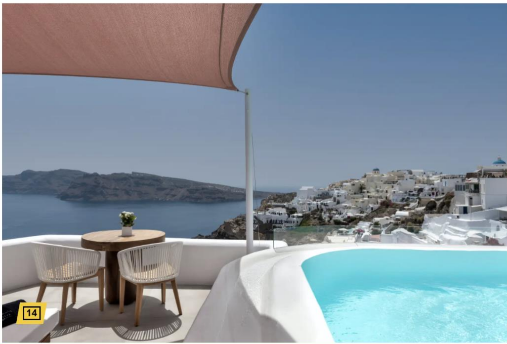
The ultra-glam Greek hideaway is beloved by royals and Hollywood A-listers. Andronis Luxury Suites